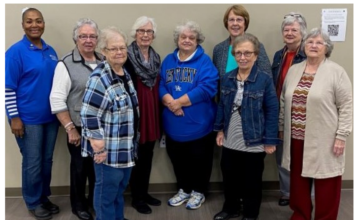
Simpson County Homemakers attending an Area Homemaker Council Meeting.

Along with these, a 2022 Homemaker Relay for Life Team raised $15,831 for the American Cancer Society and continues to raise money each year, adding to the $65,992 this team has raised to date. The Simpson County Homemakers includes leadership in the Mammoth Cave Area with positions held including Area President for KEHA, vice president, and two chairmen for the area council.