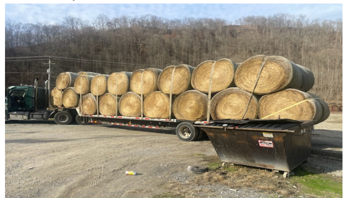
Bottom: Hay donated and delivered to Knott County, KY