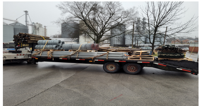
Top: Fencing Supplies loaded to be delivered to Hopkins County, KY

Following the flood, Eastern Kentucky Extension Agents and the Mountain Cattlemen's Association requested certain items which included a 3-way commodity livestock feed. A semi-load was delivered to Jackson, KY. In December, 34 rolls of hay were generously donated and delivered just east of Hindman, KY in Knott County. Simpson County's donations for both events were valued at over $18,300 total.